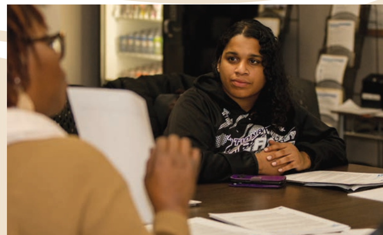
A WCS Employment and Training Services participant listens intently during an employment readiness class as she prepares for her future career.