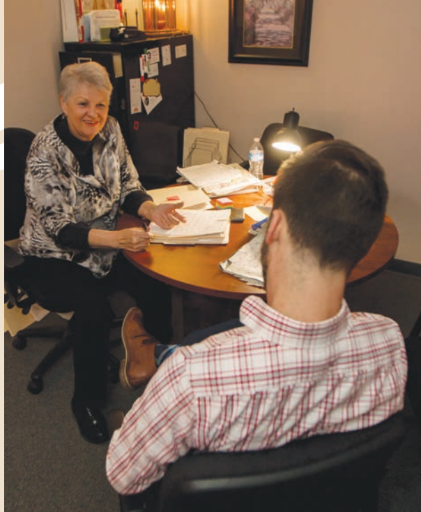
An individual receives outpatient counseling services from a WCS Certified Substance Abuse Counselor in the offices of the WCS Unlimited Potential Outpatient Mental Health Clinic (a state-licensed outpatient substance use and mental health clinic).