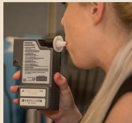
Preliminary breath testing is an integral component of supervision at WCS.