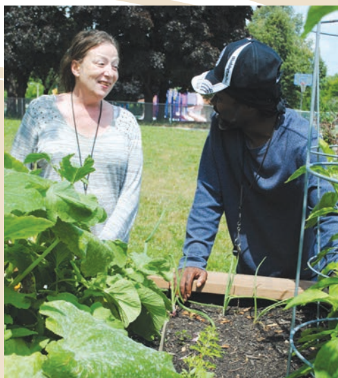
Residents of the Thurgood Marshall Apartments enjoy the outdoors while working in a garden that they planted and tended.