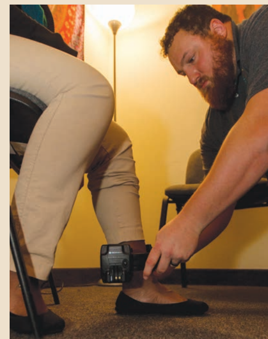
WCS has been providing Electronic Monitoring Services since 2005. During that time the agency has monitored more than 20,000 individuals.