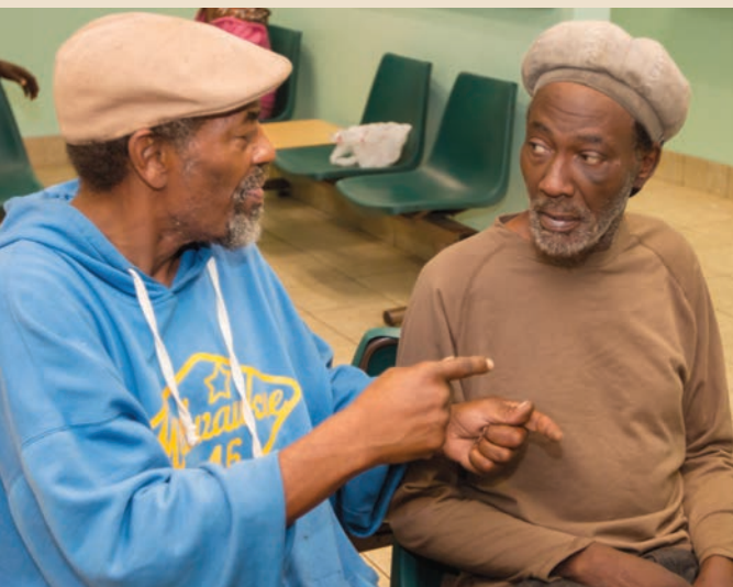
Participants of the Community Based Mental Health Programs spend a few minutes chatting before they meet with their case managers.