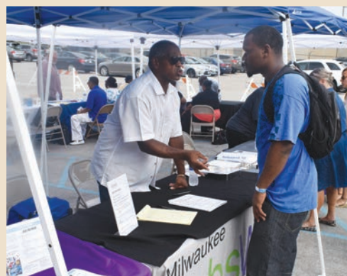
The WCS Black Male Advisory Committee (BMAC) hosted its 4th Annual Community Resource and Job Fair.