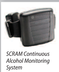
SCRAM Continuous Alcohol Monitoring System