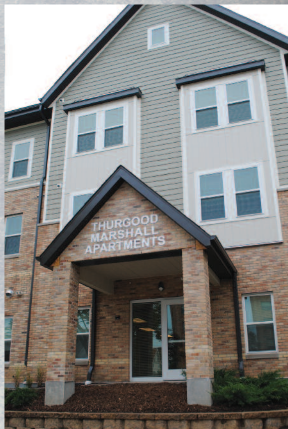
The new Thurgood Marshall apartments opened in October 2016.