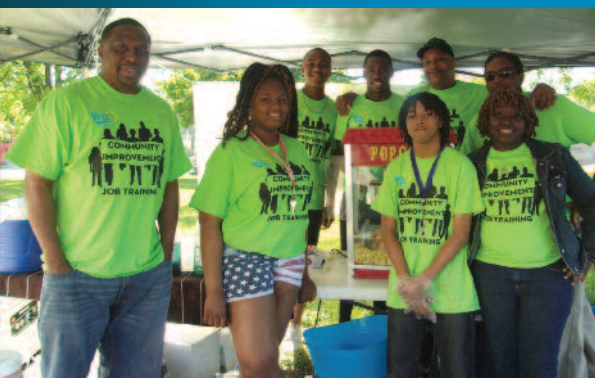
Staff and youth of the Community Improvement & Job Training program attend a summer event.