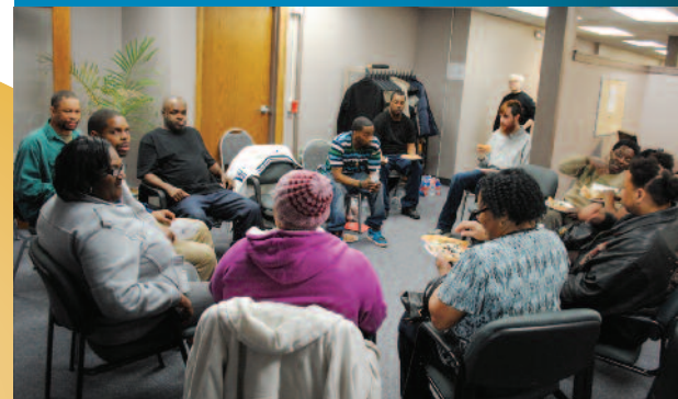
The Prison No More group, made up of WCS Forensic Services clients, meets for lunch and listens to advice from a successful past client of the program.

Wisconsin Community Services (WCS) advocates for justice and community safety, providing innovative opportunities for individuals to overcome adversity.