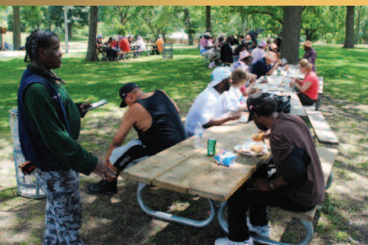
Participants of the Outpatient Mental Health Clinic spending time at the annual Clinic Picnic held in Mitchell Park.

The WCS Conditional Release Program provided community placement, monitoring and supportive case management for 152 persons adjudicated under W.S.971.12, "not guilty by reason of mental disease or defect." These clients come from five different counties and had an amazingly low revocation rate of only 3%.