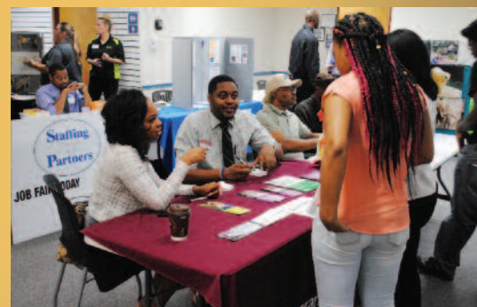
Several companies attended the Black Male Advisory Committee (BMAC) Job Fair looking for new recruits.