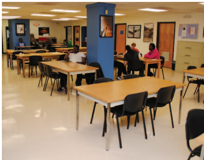
In early 2016 the Milwaukee County Day Report Center moved to its new location in the WCS Administration building on Wisconsin Avenue.