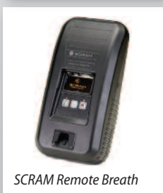
SCRAM Remote Breath